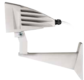
GEKO IRN 24VAC/12-24VDC