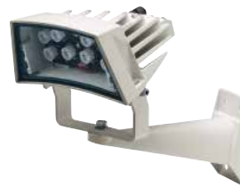
GEKO IRN 24VAC/12-24VDC