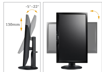
Ergonomically-designed stand allows users to tilt, pivot, swivel and adjust the height to its ideal position