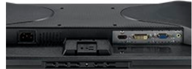
Built-in HDMI input makes the LE-22 easy to be paired with Full HD multimedia advices