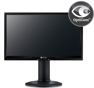
Advanced OptiCom™ Technology: Anti-blue light and flicker free for a more comfortable viewing experience