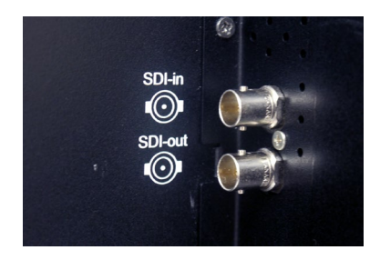
SDI inputs bring forth mega-pixel images without interruption or delay