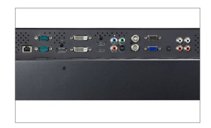
Multiple video inputs (VGA, DVI, HDMI, BNC, S-Video, DisplayPort and Component) allow for effortless system integration