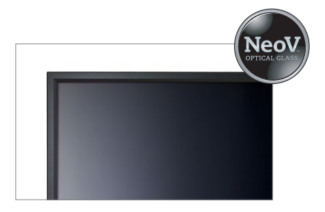
NeoV^{\mbox{\tiny{No}}} Optical Glass protects against scratches, impacts and other physical damage