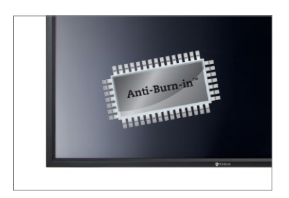
Anti-Burn-in ^{\bowtie} technology prevents image sticking