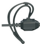
Ear hanging accessory