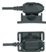
Head Strap Mount