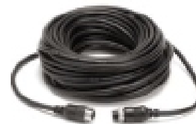
4 PIN EXTENSION CABLE10