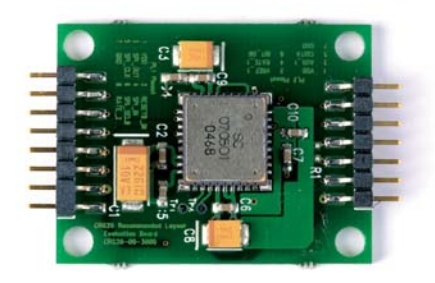
Development facilities available please enquire

Silicon Sensing Systems Limited Clittaford Road Southway Plymouth Devon PL6 6DE United Kingdom